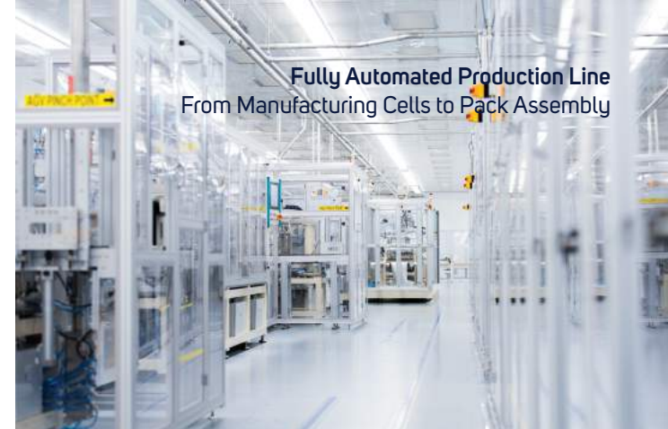
Fully Automated Production Line From Manufacturing Cells to Pack Assembly